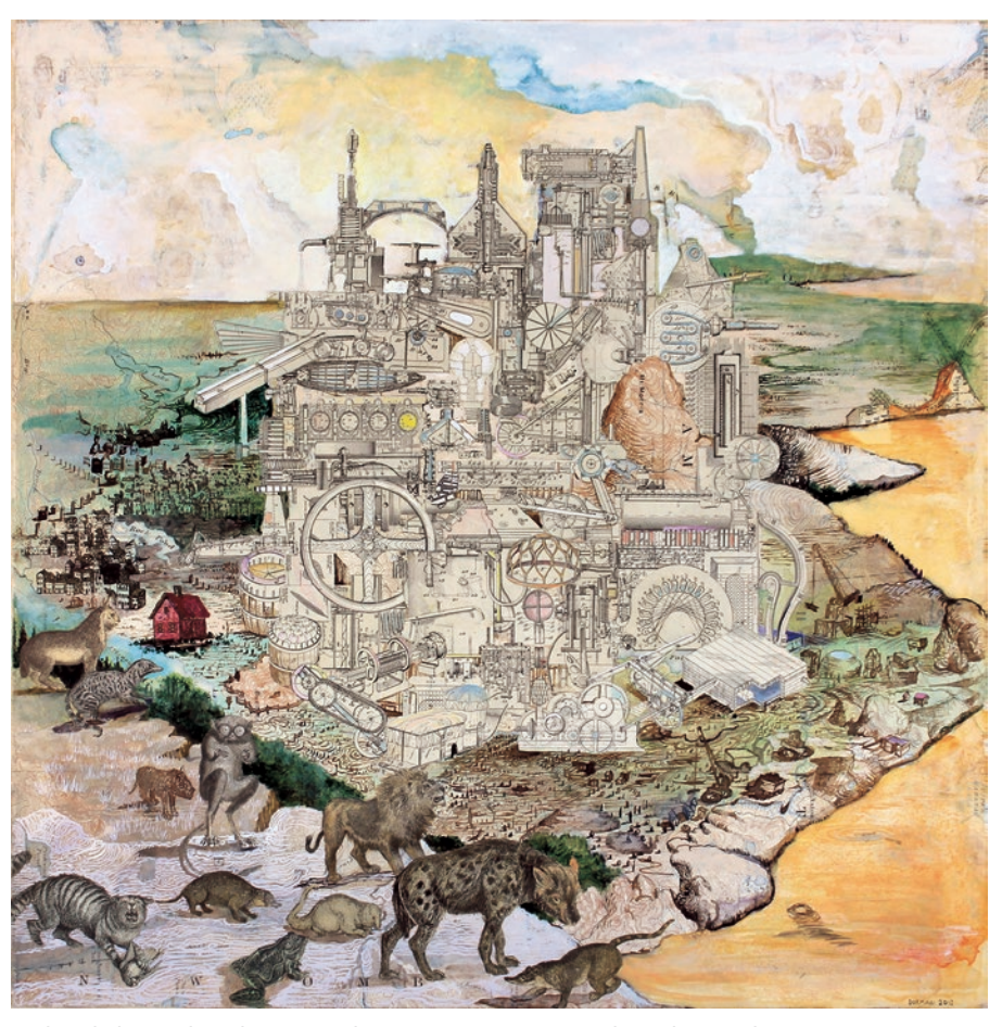
Little Babel, mixed media on panel, 18 x 173/4".

Re-presenting Representation exhibitions which promote realism in its many guises. John was chair of the Artists Panel of the New York State Council on the Arts. He writes for gallery publications around the world, including regular monthly features on Art Market Insights and on Sculpture in Western Art Collector magazine.