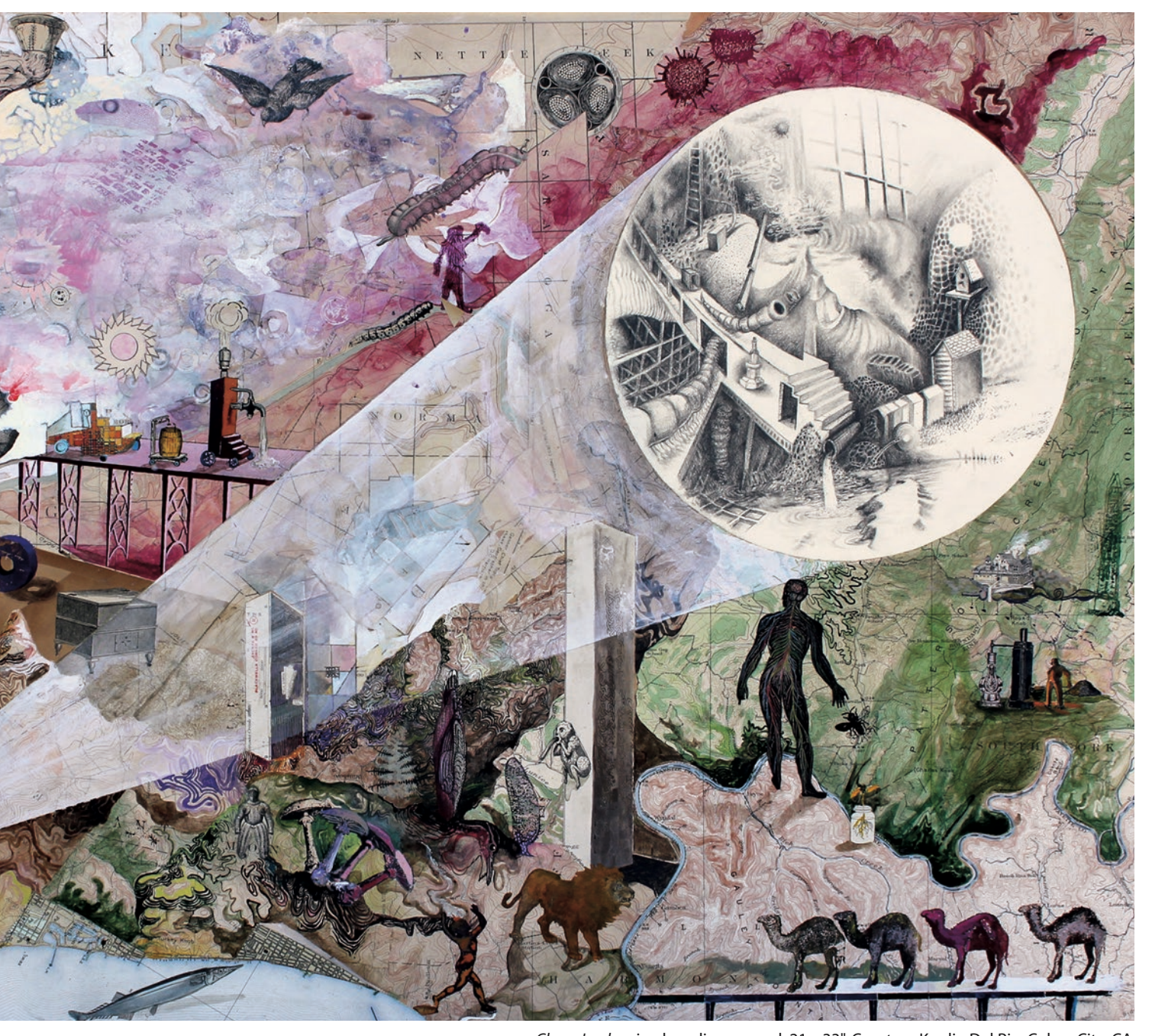
Closer Look, mixed media on panel, 21 x 33".

in overall pattern but I want people be able to read some kind of scene."